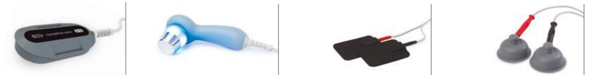
Accessories for BTL-4000 SMART / PREMIUM