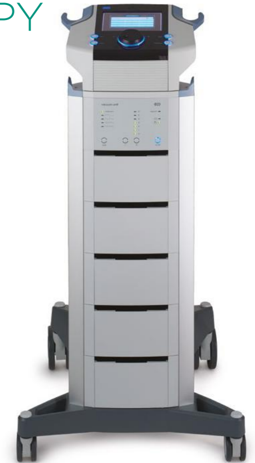
Accessories for BTL-4000 SMART / PREMIUM